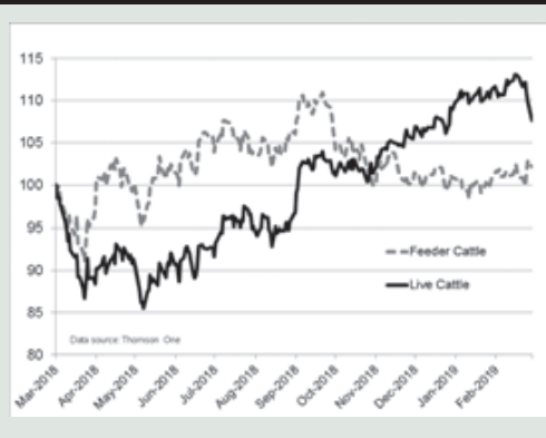
CASH CATTLE INDEX PRICES

Combined, all this report information will affect the cattle market but just to what extent?